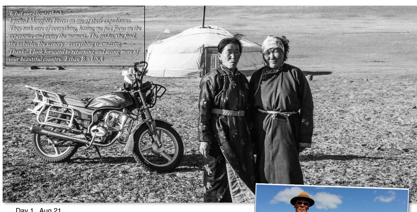
Day 1. Aug 21

Ulaanbaatar - We'll meet you upon your arrival and get you to your hotel. If you're up for it we'll take you out for a city tour of Ulaanbaatar, have lunch and then take care of any last minute purchases. Dinner together at one of the nicer places in the city, since things from here on out may be a bit more... rudimentary.